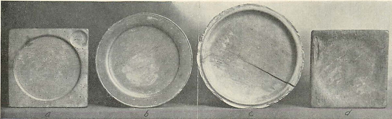
Fig. 1—Four Treen plates of different periods. The square examples are the earliest, and the one on the right is probably mediaeval. They are from the collection of Mr. Oliver Baker of Stratford-on-Avon. The two centre pieces are described under Fig. A., one is dated 1607. The square examples are 5½ inches across.