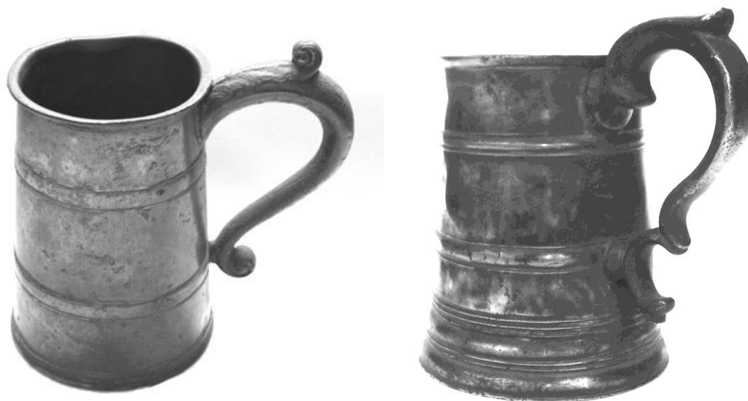
Figure 1. Two Irish measure two banded quart pots. Such pots are very rare as after 1826 they did not conform to a legal standard so were always at risk of being destroyed. The one on the left has a type of handle with acanthus leaf decoration which has not been reported before. The one on the right is conventional as far as that can be said for a rare type. The left hand one can be dated to circa 1760/1780.