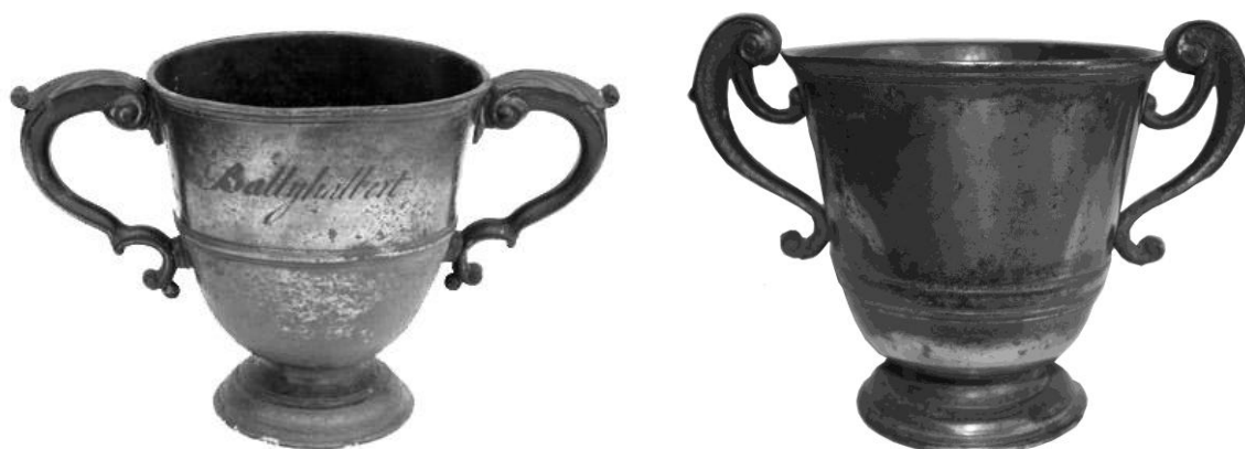
Figure 2. Two two-handle cups both of types previously known in silver but not reported to have been made in pewter. Silver cups of the style of the left hand example are well known in Irish silver and usually with the acanthus leaf handle date from between 1750 and 1780.