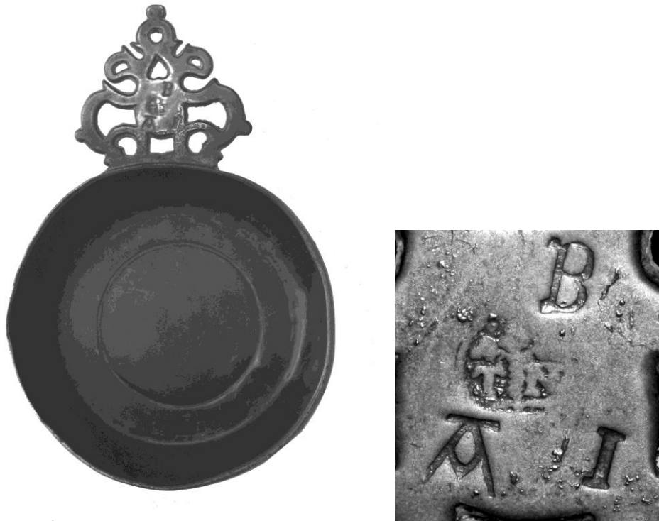
Figure 6. No Irish made porringer has been identified but as there were many pewterers and braziers in Dublin in the last quarter of the 17 th century it seems possible they were made. The porringer below appeared in a sale in Edinburgh of a collection of antiques assembled by a Northern Ireland collector. The other two pieces in the lot were 18 th century Irish pewter. The “TN” mark has been previously recorded but not identified. Some think the decoration in the mark shows flowers others shamrocks.