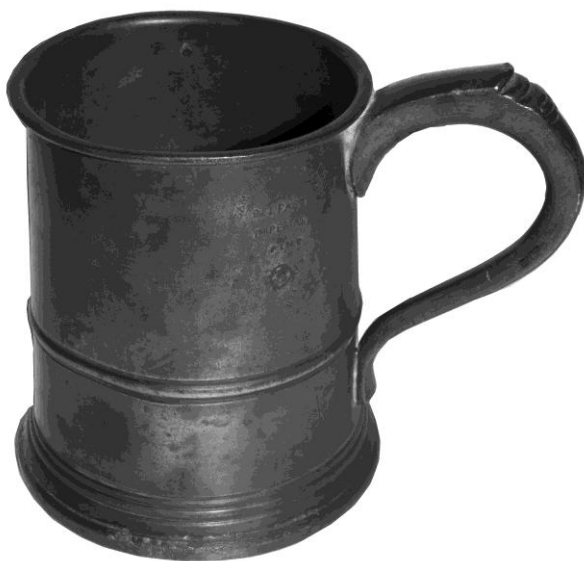
Figure 5. A one-pint Imperial truncated cone mug marked "CAMPBELL of BELFAST". Campbell and Co. seem to have been hardware merchants in Belfast from circa 1850, later in the 19 th century becoming jewellers. They have been known for a long time for their two handle pewter cups and recently for selling concave pewter mugs. This is the first truncated cone pot known with their mark on.