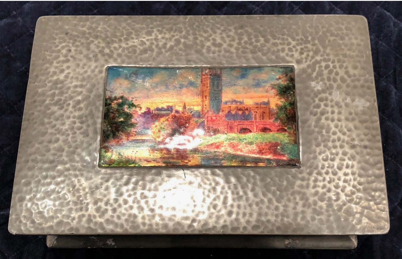
Size 8" x 5 1/4" x 2 3/4" approx

Seen at PAYNES OF OXFORD - SILVERSMITHS AND GOLDSMITHS - HIGH STREET OXFORD.