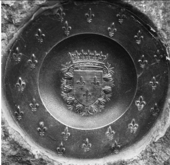
Trim off any excess silicone when fixed