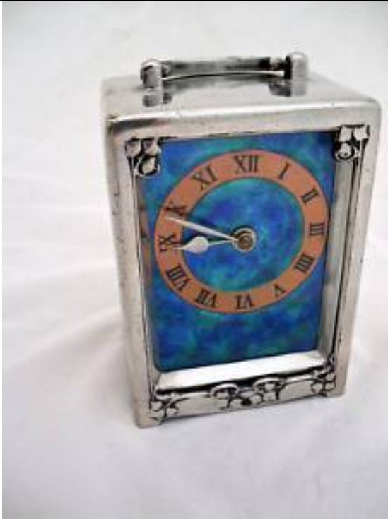
Liberty & Co Tudric clock ,pewter with enamel face .approx 5" tall ,3 x 3.25" at the base