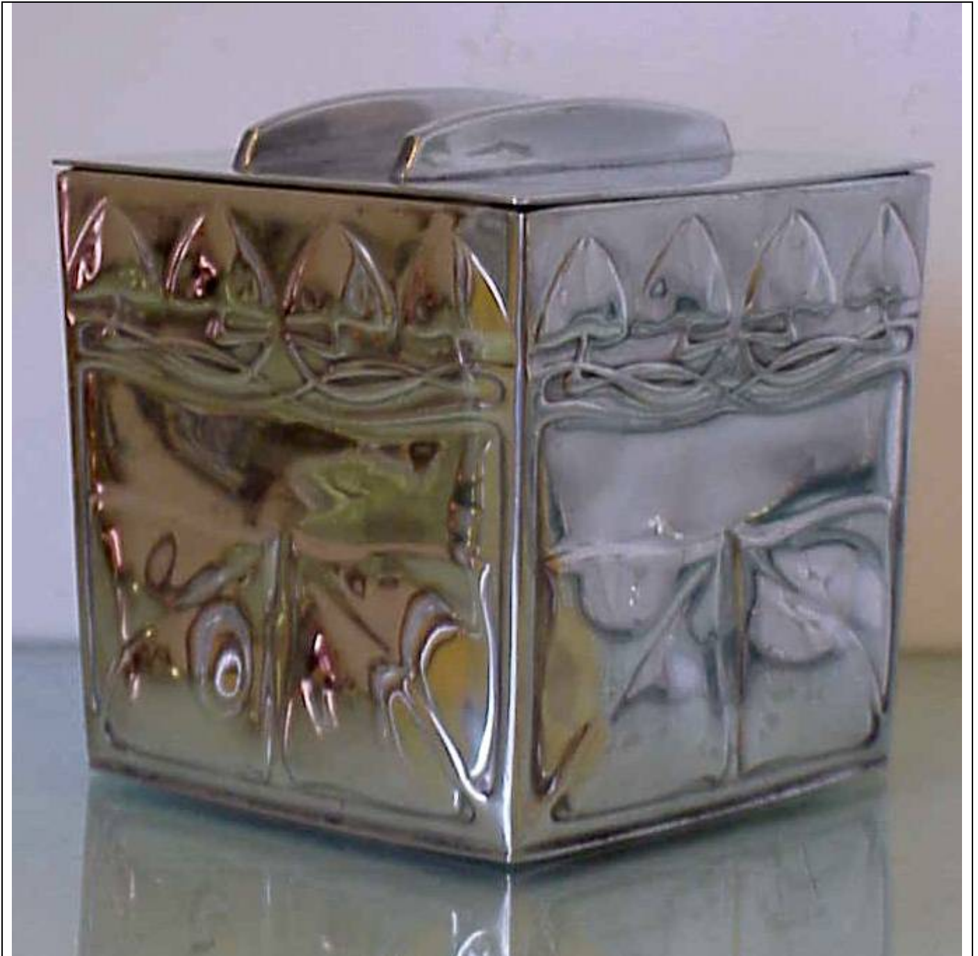
Liberty & Co Tudric Biscuit Box designed by Archibald Knox Design Number 0237 – size 4.5”square by 5” tall Market Price today dependant on good to immaculate condition £850- £1000