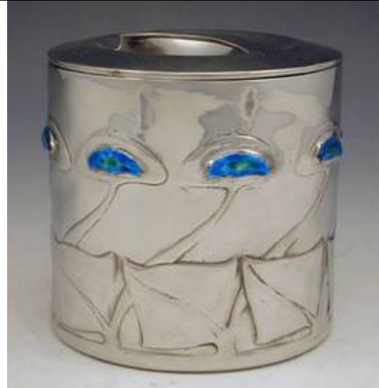
Tobacco Jar - Designed by Archibald Knox for Liberty about 1904 11.5cms tall and diameter

Designed by Archibald Knox for Liberty around 1905 and about 10.5cms tall (less than £1000)