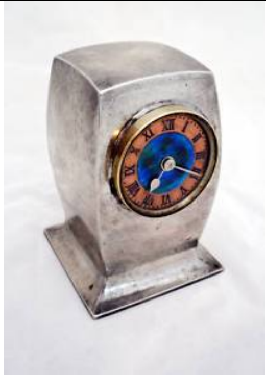
Liberty & Co Tudric clock ,pewter with enamel face .approx 11 cm tall ,7.5 x 7.5 at the base