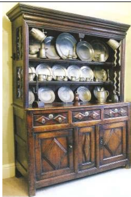
illustration 583 - Oak dresser, Vale of Ffestiniog, Merioneth, c1670 – 1690