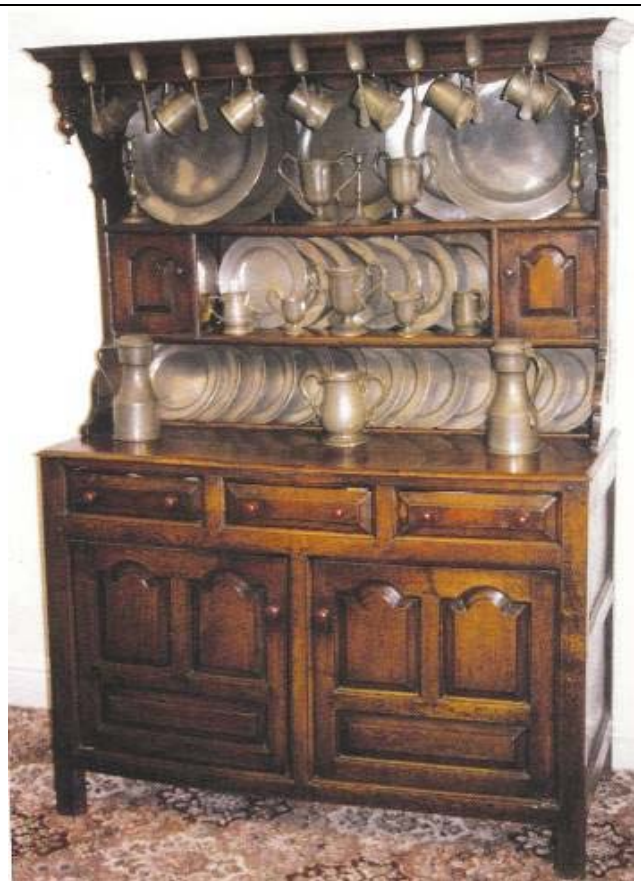
illustration 590 - Oak Dresser, Cricieth District, Caernarfonshire c1690 – 1720