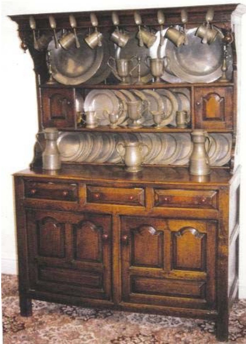
590 - Oak Dresser, Cricieth District, Caernarfonshire c1690 – 1720