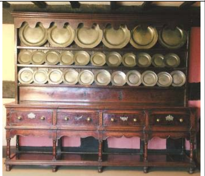
illustration 881- Oak Dresser, Tregynon, Montgomeryshire c1720 – 1750