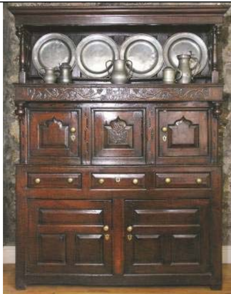
illustration 830 - Oak Cwpwrdd tridarn, Conwy Valley initialled and dated 'WRK 1731' (raised R)