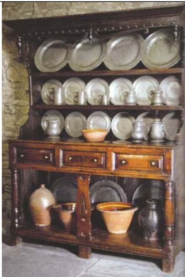
illustration 587 - Oak Dresser, Denbighshire, Merioneth c 1680 – 1710